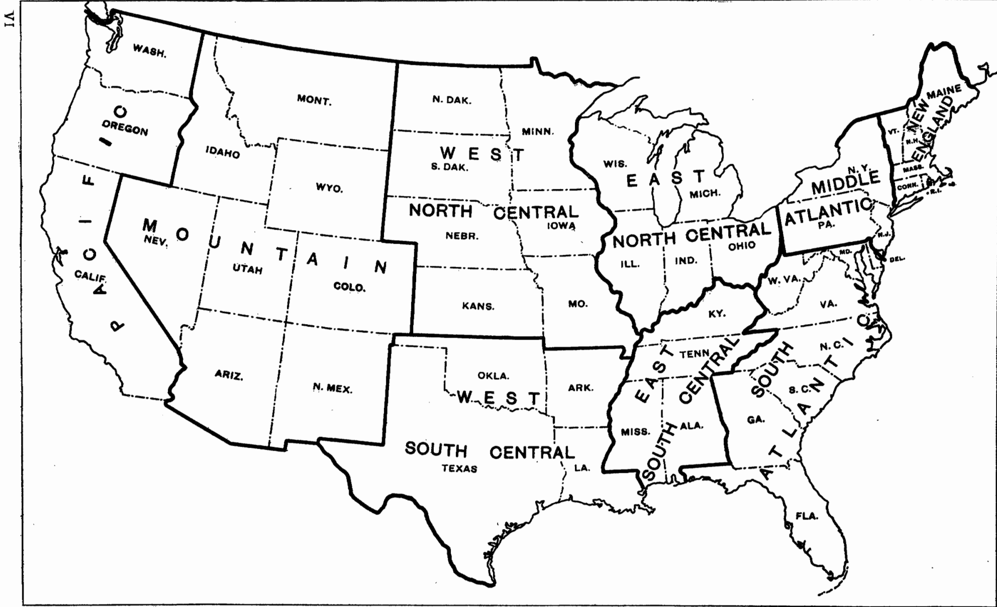
Map of the United States. Showing Geographic Divisions