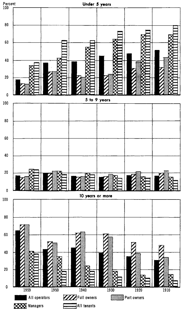
PERCENT DISTRIBUTION OF FARM OPERATORS BY YEARS ON FARM, BY TENURE, FOR THE UNITED STATES: 1910 TO 1959

There was very little difference in length of time on present farm between full owners and part owners in any of the regions. For the United States, approximately 72 percent of the owner-operators had been on their farms 10 years or more; 16 percent, from 5 to 9 years; and 12 percent, less than 5 years. The tenants, however, were grouped mainly into two groups. Approximately 38 percent of the tenants of the United States had been on their present farms 10 years or more and an additional 38 percent had occupied the present farm less than 5 years. Nearly one-half of the croppers had been on their farms less than 5 years.