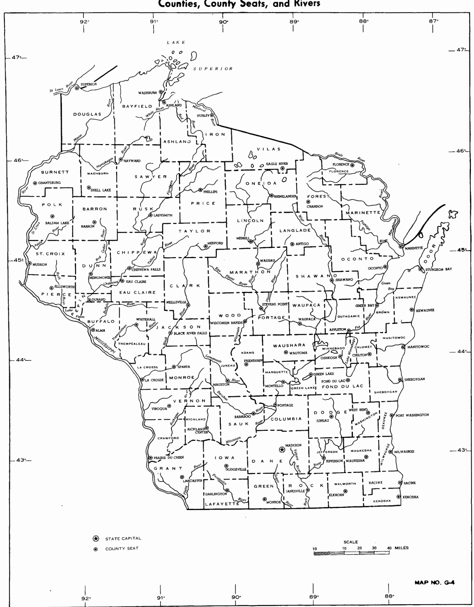
WISCONSIN Counties, County Seats, and Rivers