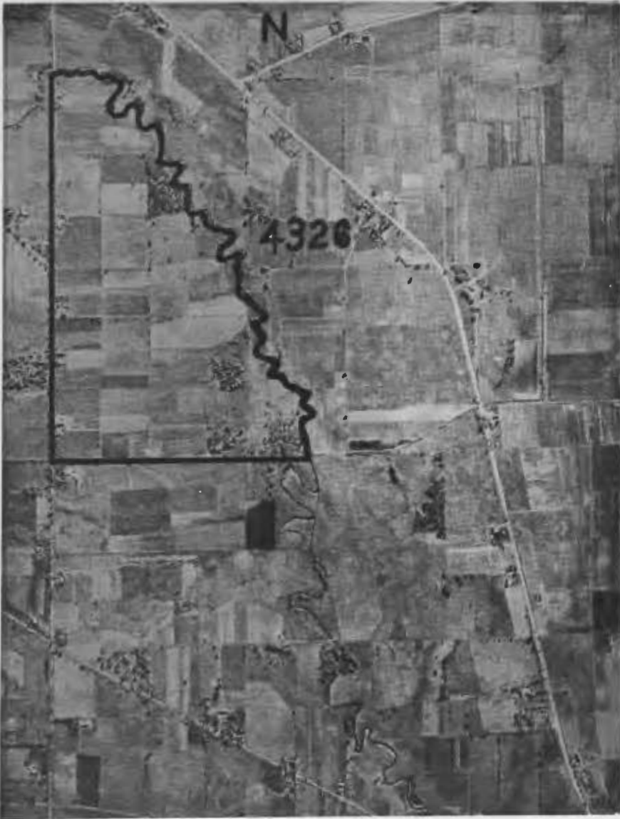
FIGURE 1 Example of aerial photograph showing a typical segment with segment designation number.